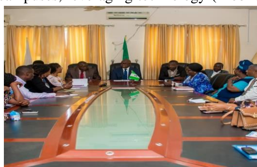
Campus Initiative Project: A Management meeting on project implementation

Our Campus Initiative Project is a Ford Foundation funded project launched in 2018 and implemented in 4 tertiary institutions in Nigeria aimed at instituting a model policy template and guideline on sexual harassment prohibition in campuses, leveraging technology (Mobile App adoption) for safe reporting, data generation and training students (Campus Ambassadors) to be proactive and reactive bystanders on all forms of GBV in their institutions. In 2018, the Campus project was launched in 4 institutions and was scaled up to 101 Nigerian tertiary institutions in 2020. The project aligns with the Sexual Harassment Prohibition Bill in Tertiary Institutions passed by the National Assembly in 2020, focused on strengthening institutional response to reports of sexual harassment on campus.