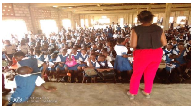
Adolescent Hub Program: providing adolescents with SGBV tools and information and helping them develop confidence to break the repressive culture of silence

According to UNICEF, 6 out of every 10 children experience sexual, physical or emotional violence before the age of 18. This profound finding represents this as a problem that requires context specific intervention. In response to this epidemic proportion of SGBV in high schools, the Adolescent Hub Program, a curriculum-based prevention program targeting in-school adolescents between ages 12 to 19 was implemented to equip Adolescents with the tools, skills and resources to prevent and respond to SGBV while catering to their physical and psychological wellness.