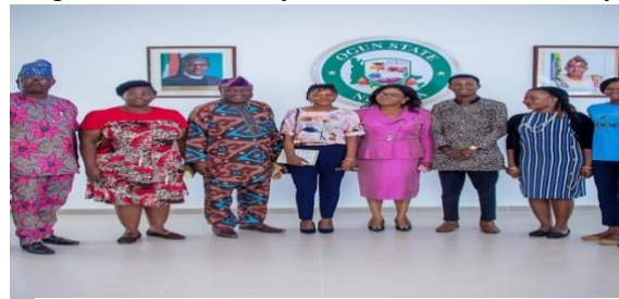
Gender Mobile Team photographed with some Tertiary Institution Management Staff

In 2020, we held 47 meetings with members of management of tertiary institutions. 12 tertiary institutions have signed Memorandum of Understanding (MOU) with Gender Mobile and 12 institutions have developed model policy templates and guideline on sexual harassment prohibition. In line with agreed MOU on the Campus Initiative Project, 10 institutions have received mini grants to facilitate model policy validation processes, disseminate copies of policy and Mobile App adoption. The Campus Initiative Project has also equipped 14,535 students with knowledge on SGBV prevention and response, sensitization on Bystander Intervention and information on channels for safe reporting on sexual harassment.